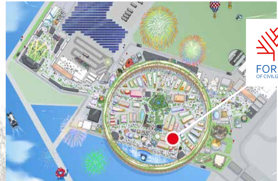
Map of Expo 2025 “inner ring” with marked location of every national pavilion

An ancient forest installation featuring world unique 6,500-year-old subfossil oak trees, with each tree dedicated to one participating nation of the Expo 2025. Each tree will be name after “its” nation. With thousands of years of history encrypted within the annual rings of these venerable trees, they will symbolically connect the entire world within one “root system”, one organic entity. As a first-hand witnesses to the time of the formation of the first civilizations, they narrate – year by year - the story of the development of our planet, and along with it the story of the humankind.